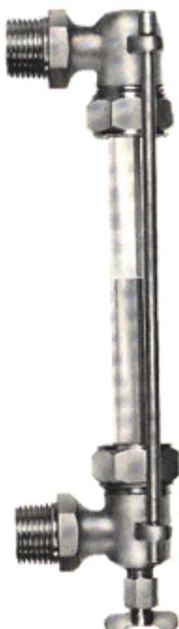
Expansion Tank Type No. 00000, 0000, 00