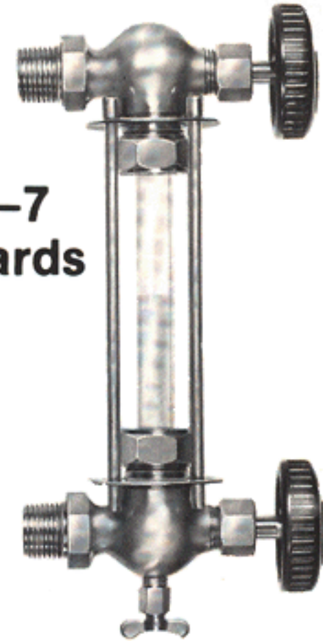
Nos. 5—7 Four Guards