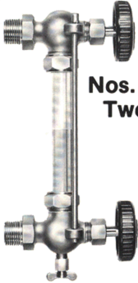
Nos. 0—3—7 1 / 2 Two Guards

Polished Round Body, Composition Wheels Tested for Pressures to 200 Pounds